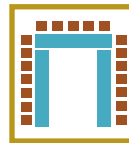
Table with chairs all around it. Maximum Seating: 30